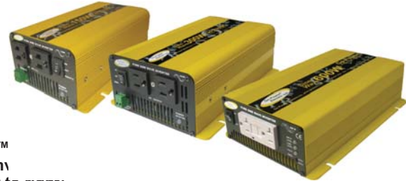
The Go Power!™ and SW600 W In above (from left to right)